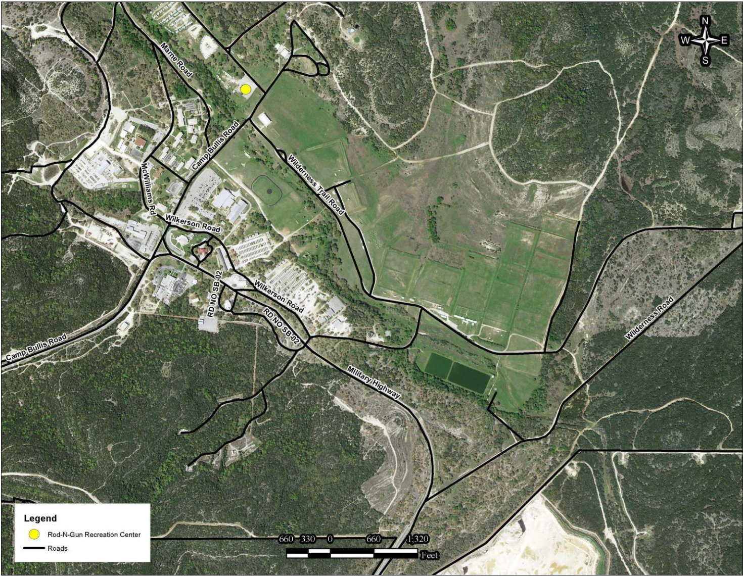
Map 1 Rod-N-Gun Recreation Club, Building 6215 Location